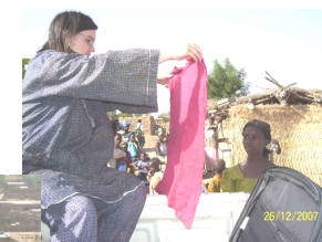
CLOTHING THE POOR