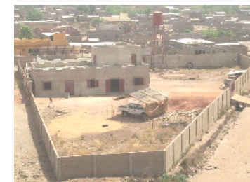
BUILDING A BASE FOR 200 CHILDREN AND WORKERS