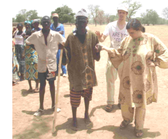
HEALING THE SICK