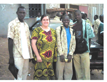
with the school director's children